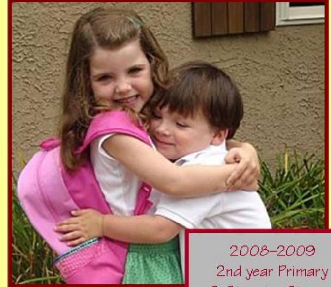
2008-2009 2nd year Primary & Stepping Stones