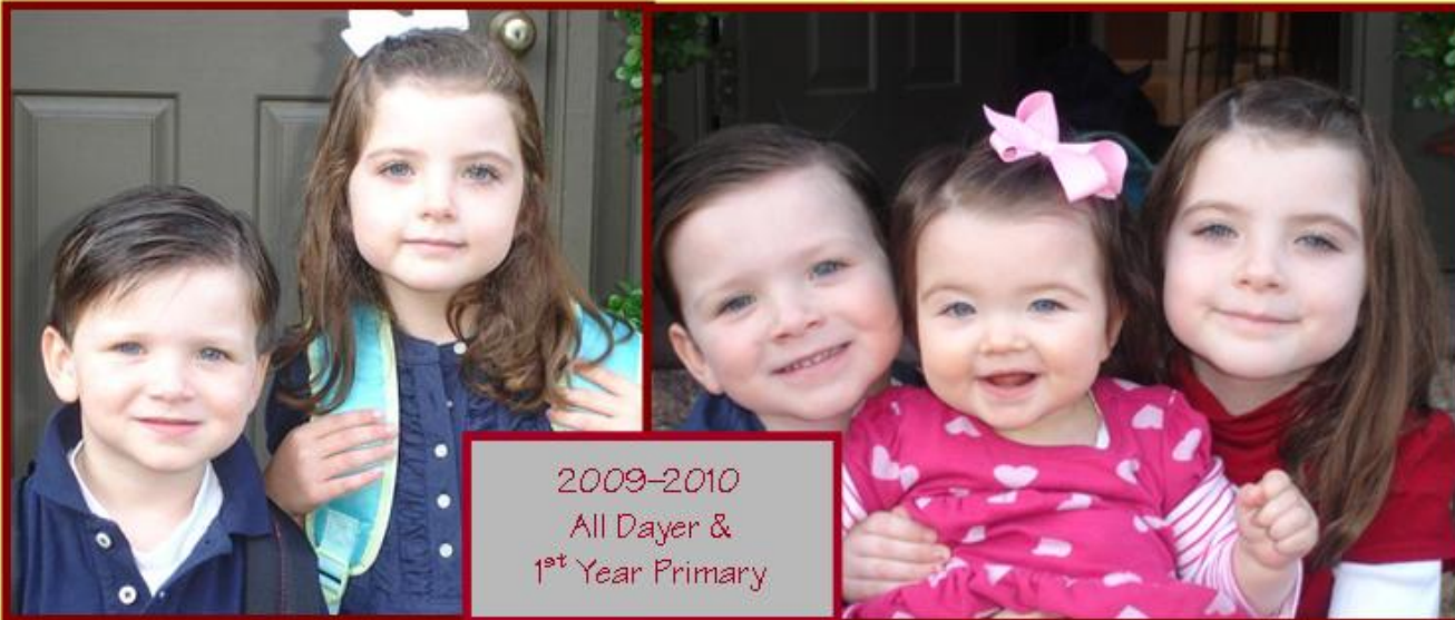
2009-2010 All Dayer & 1 st Year Primary

Thank you Gladwyne Montessori for four excellent years of learning, friendship and fun. You have given us such an amazing start.