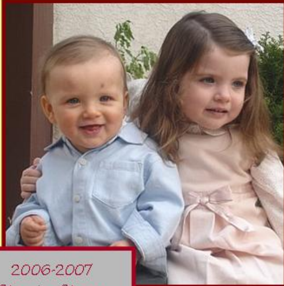
2006-2007 Stepping Stones