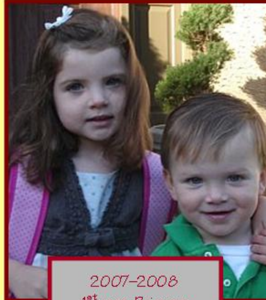
2007-2008 1 st year Primary